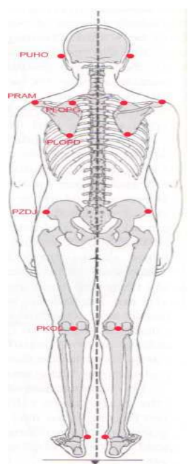
Figure 1 - Reference points in posterior examination of body posture (17)

Processing of data that was collected by the said experimental procedure was done for each class separately (by age), and all data was processed with Statistica 7 statistical set (StatSoft, USA), and SPSS 16 (USA).